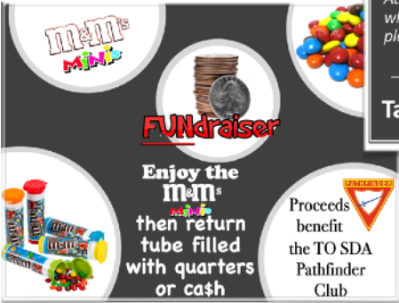
Table located outside foyer